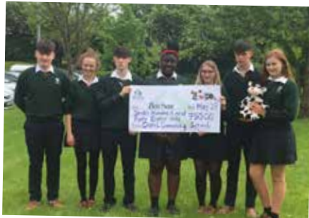
Students from Cashel Community School, Cashel, Co. Tipperary were delighted to hand over this cheque for €750 to Bóthar recently. A lot of hard work went into it but their efforts were rewarded! From Christmas dinners to leg waxes, the students and teachers dug deep for Bóthar. Thank you one and all.