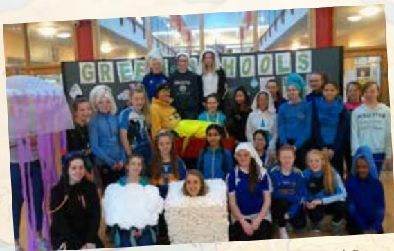
Well done to students from Loreto Secondary School in Clonmel, Co. Tipperary who raised funds on behalf of Bóthar. Serious effort from all involved. On behalf of the families you helped with your efforts, thank you.

Each school will receive a certificate that can be hung on the school notice board to highlight their efforts!