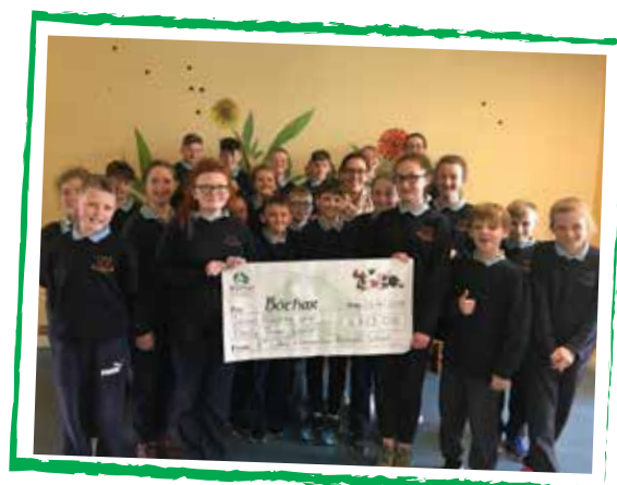
Huge thanks to Clonmellon National School, Clonmellon, Navan, Co. Meath. They had a dodgeball tournament and raised an incredible €733 to send 2 goats and 2 sets of rabbits to help struggling families in the developing world. An amazing amount of money to raise. Well done to each and every one of you!

In order to help your pupils understand where their donation will be going, Bóthar will send a class speaker to your school to explain the work we do. If you are interested please download and fill in the class speaker booking form on our website and return it to us or email info@bothar.ie with your request.